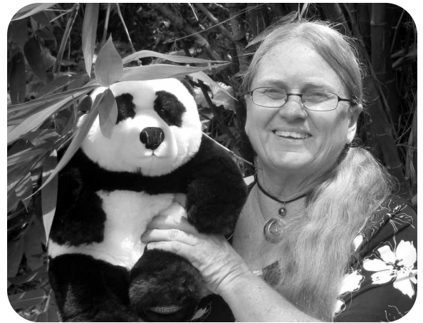
Bamboo provides food for pandas and hundreds of useful products for people. Via garden programs, island children learn about the importance of plants in our daily lives and the need to preserve forest habitats.

Congratulations, Olive, and many, many thanks for the remarkable work you do!