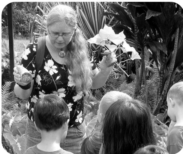
Sweet potatoes are good to eat and easy to grow in your garden.